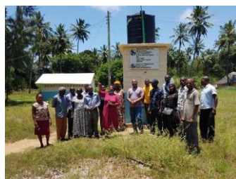
Official opening Mkongani worship centre primary school