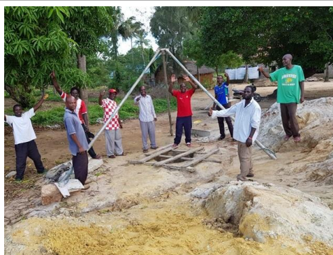
The first project in Corona time