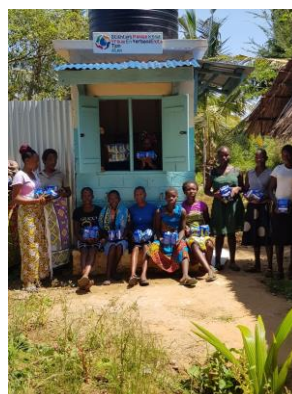
Official opening girls project in the suburb of Kararacha village