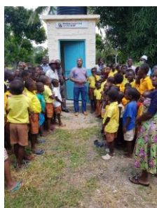
Official opening primary school Sidzeni