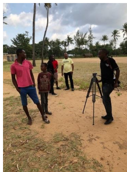
Filming a scene for the documentary

On Saturday March 14, 2020 while I was in Kenya, a friend called me and told me that Kenya Airways was cancelling flights due to Corona! I did not realize at all, but I was convinced that I had to go home asap. On Sunday, March 15, 2020 I flew back from Malindi to Nairobi and at night I literally had the last flight with KLM back to Amsterdam where I arrived at 6.45 a.m. Dutch time on Monday morning.