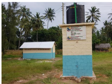
Oyumbo Primary school