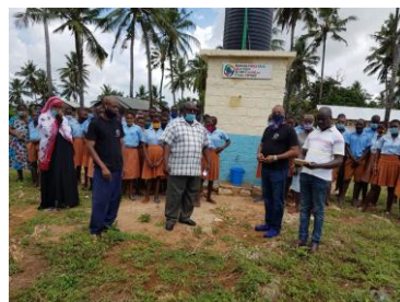
Official opening primary school in Kilodi