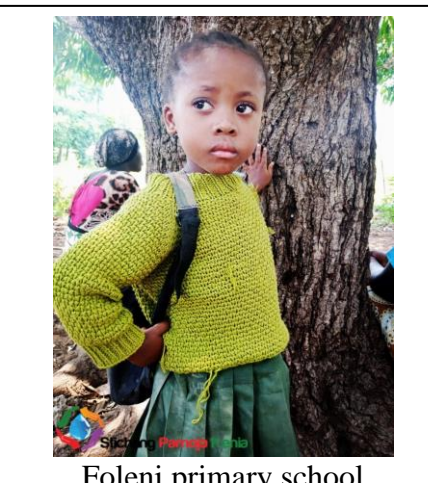
Foleni primary school