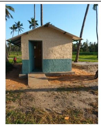
Sanitation block Madeteni Ladies and Men showers and toilets