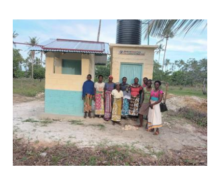
Second woman group in Kararacha